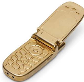
Marisa Olson Untitled (from the series "Time Capsules") Estimate: £800-1,200