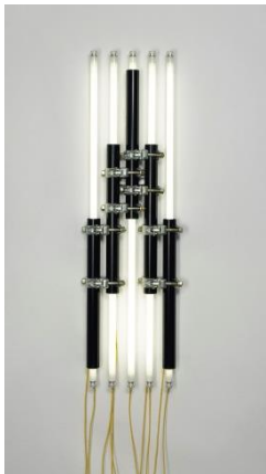
Nathaniel Rackowe SP21 Estimate: £5,000-7,000