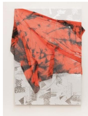
Roman Liška Untitled (Silver Dazzle Orange Mesh) Estimate: £4,000-6,000