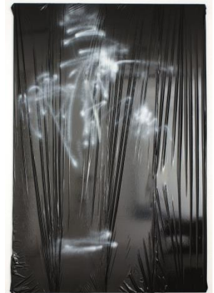
Michaela Zimmer 140801 Estimate: £4,000-6,000